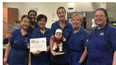
Central Middle School