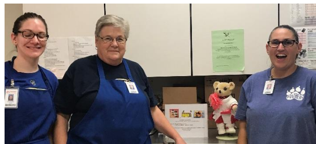
Shenandoah Elementary School